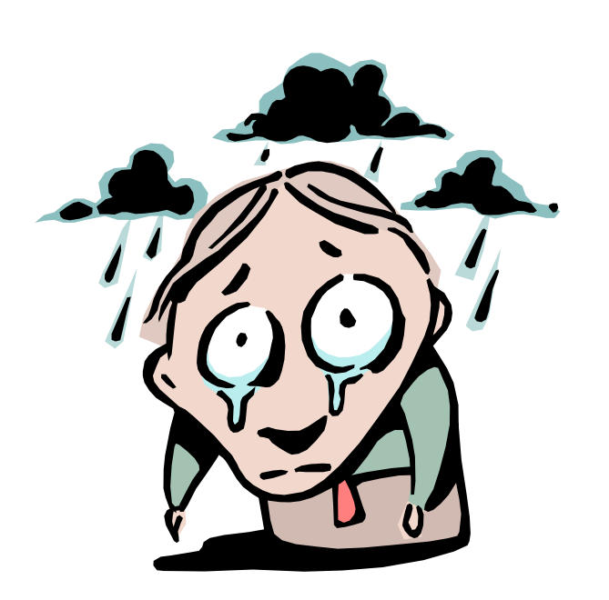
University of Colorado Lobbyist