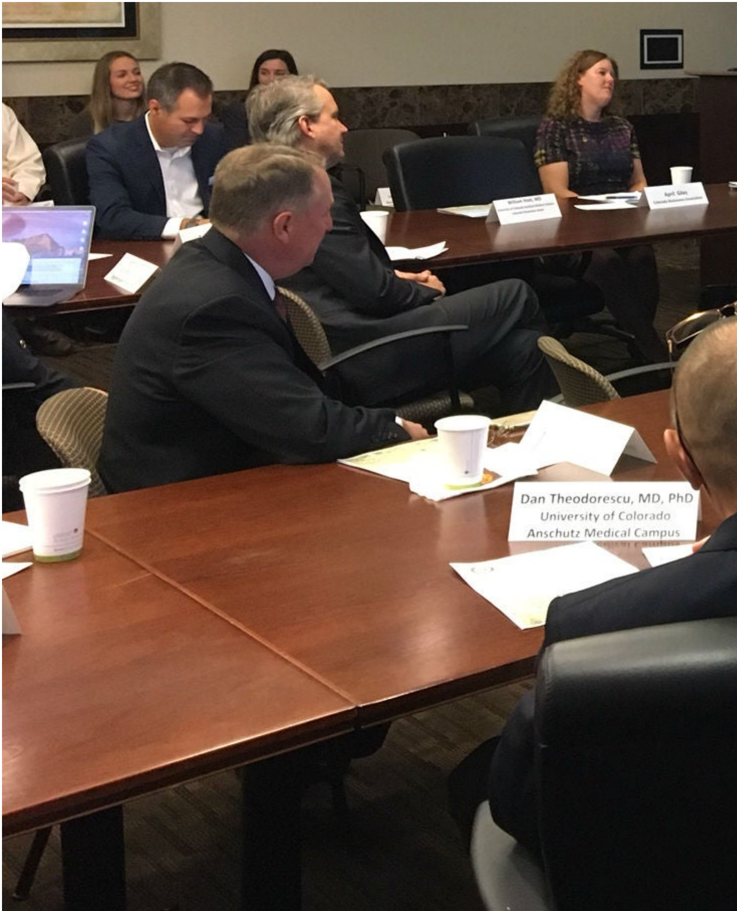
Senator Michael Bennet, FDA Commissioner Scott Gottlieb, and CU Anschutz Medical