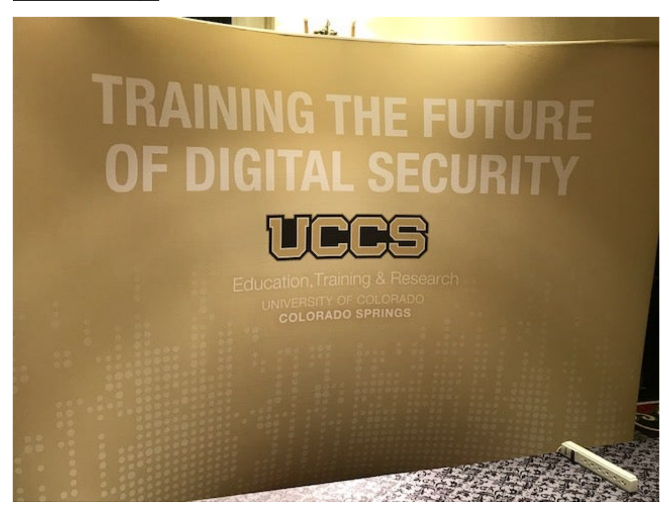
UCCS Co Sponsored the 2017 National Cyber Symposium

UCCS Chancellor Venkat Reddy outlined an agreement with Cisco to assist in designing a strategic plan for a Cybersecurity Workforce Development Center in conjunction with the National Cybersecurity Center. Cisco representatives will work with UCCS faculty to develop capabilities for the development of curriculum and training of people to work in cybersecurity, joint research opportunities and student internships. Read more about the plan in the UCCS Communique [16].