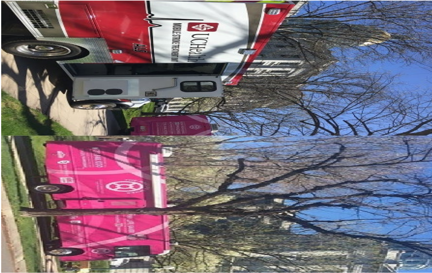
Mobile Stroke Unit and Pink Life Saver Van in front of the Capitol for UCHesth Advanced Care Close to Home Day.