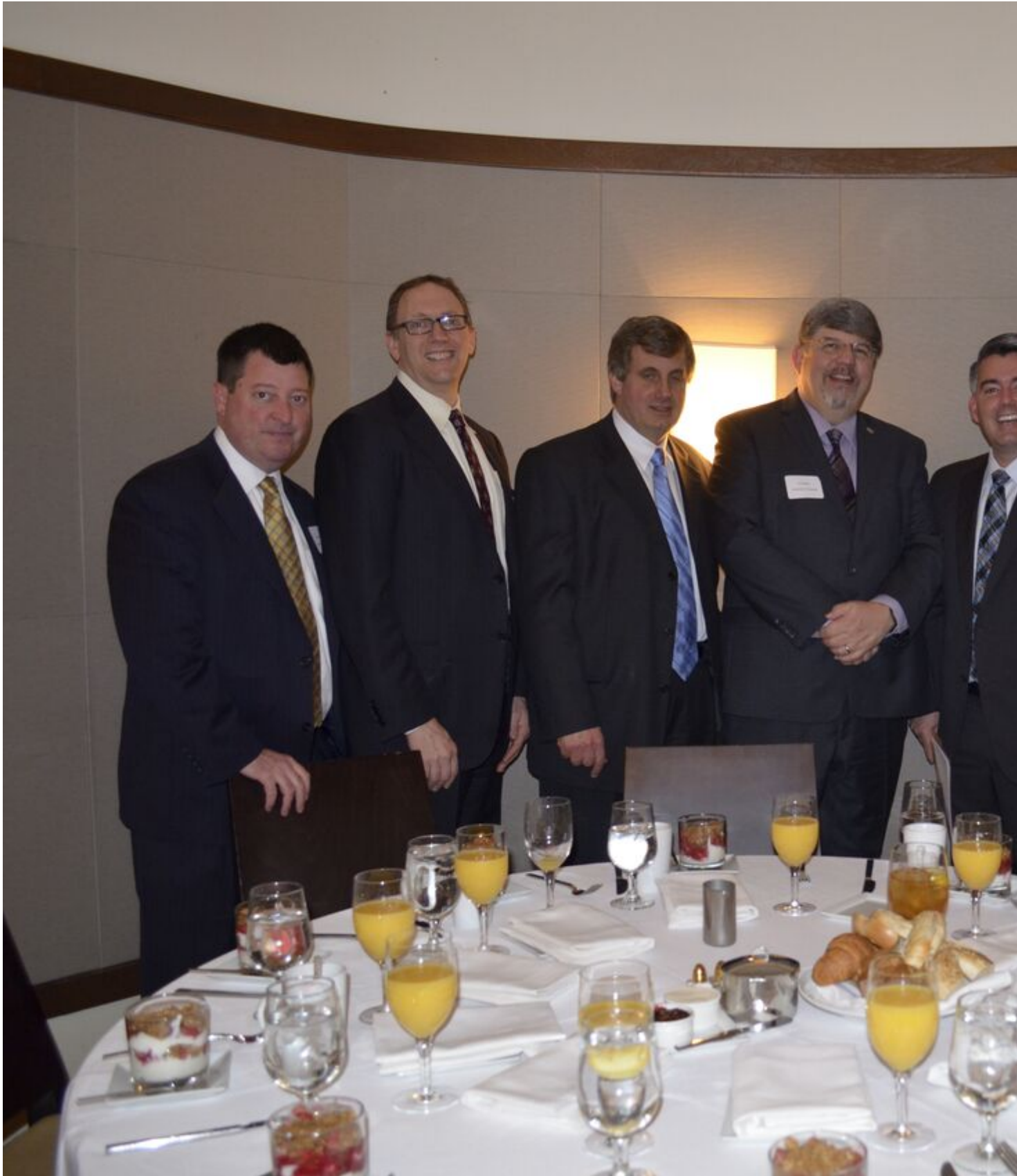
U.S. Senator Cory Gardner at the Science Coalition Headliner Breakfast