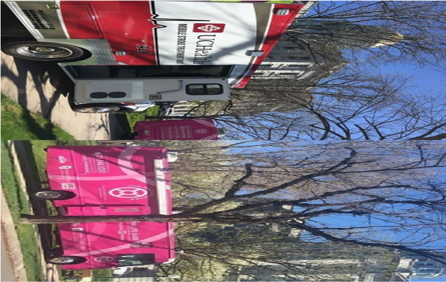
Mobile Stroke Unit and Pink Life Saver Van in front of the Capitol for UCHesth Advanced Care Close to Home Day.