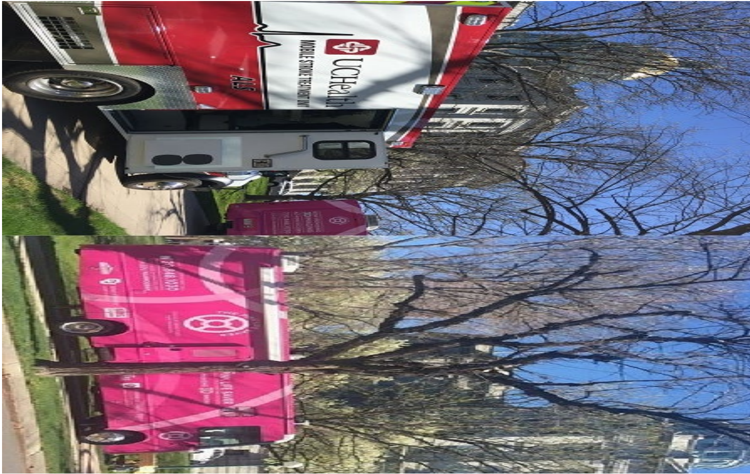
Mobile Stroke Unit and Pink Life Saver Van in front of the Capitol for UCHealth Advanced Care Close to Home Day.