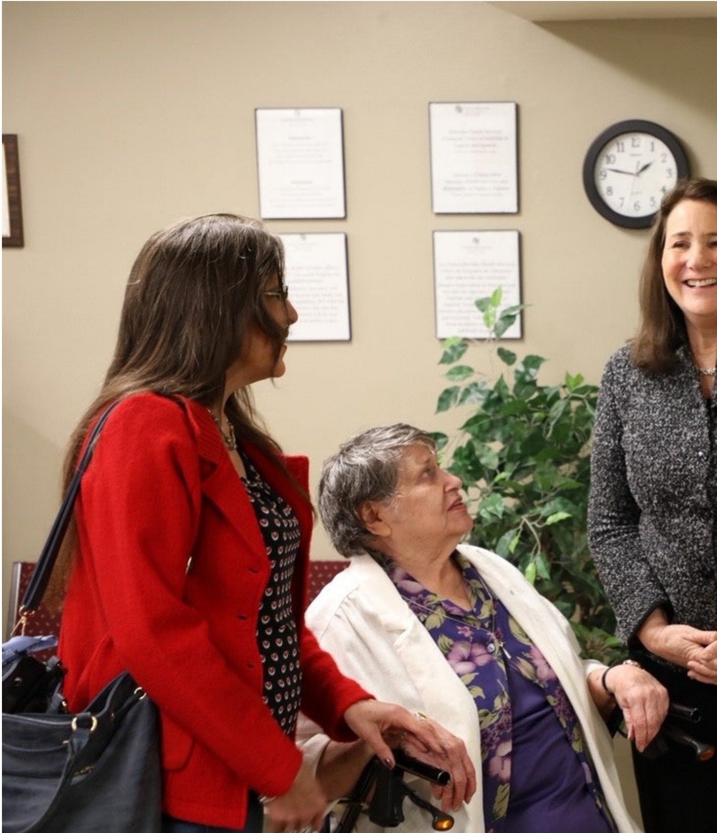
Congresswoman Diana DeGette speaks with patients at Sheridan Health Services