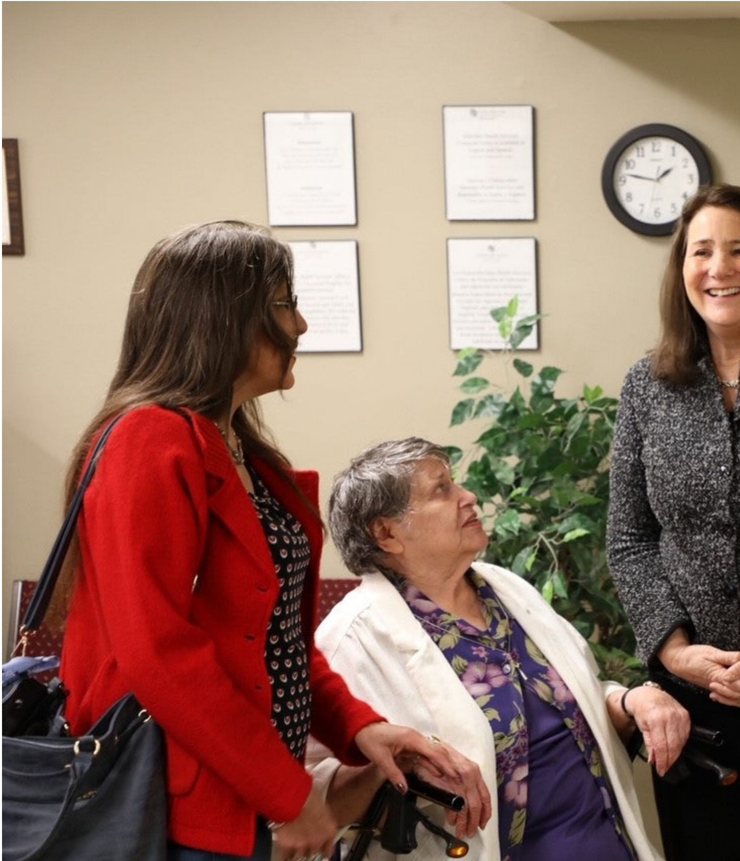
Congresswoman Diana DeGette speaks with patients at Sheridan Health Services